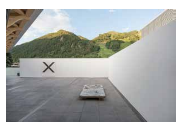
Installation view Wade Guyton Peter Fischli David Weiss , Aspen Art Museum, 2017.

BIO You mentioned that this exhibition was something you had to go to Aspen to experience. But the show was extraordinarily well documented, even utilizing 360° technology within each gallery to give a complete record of the relationship between works in the installation. The availability of comprehensive documentation of installations, let alone 360° documentation, seems to be an anomaly within museums—many have no installation images available online, and others have only a small selection of images available on their websites. Of course, not everyone can travel to experience every exhibition, so it seems potentially beneficial to offer some degree of a virtual simulation. However, I am always frustrated with the sense of loss that comes with documenting artworks or exhibitions. Images of artworks and exhibitions always feel incomplete, distant, flat, and muted. Even the 360° vantage point doesn't capture the physical experience of walking through a show. It seems that this ability to record an exhibition, which in the past